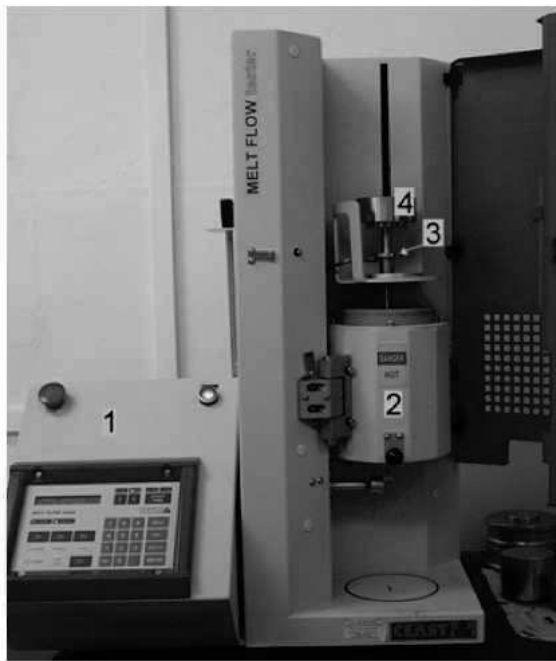
Fig. 1 MeltFlow Index Tester extrusion rheometer (1 control panel, 2 cylinder, 3 piston, 4 weights)

Measurement of melt flow volume rate was performed at the Technical University of Liberec, Faculty of Mechanical Engineering, Department of Engineering Technology. The extrusion rheometer at which the measurement was made is shown in Fig. 1.